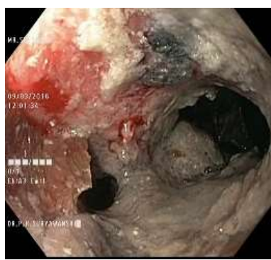
Fig-4b-oesophagus and oesophagopleural fistula