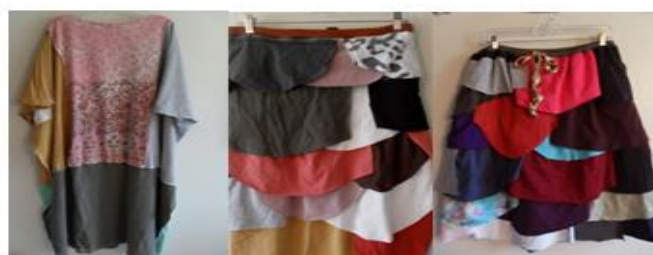
Figure 1: Cardigan Figure 2: Skirt Figure 3: Skirt

As mentioned in the fashion blog by Erica (2016) known as “fashion recycled”, which puts used apparels on auctions to be sold to charity shops, car boot sales, garage stores, thrifts stores and vintage store. This blog was developed as a way to network the whole world and provide information regarding recycling fashion, fashion styles, fashion ethics, shopping at second-hand shops and more. Figure 1, 2 and 3 illustrates designer Creolesha designing apparels from recycled apparels such as different types of arms being cut and combined together as skirts.