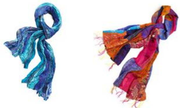
Figure 10 shows hand-made saree scarf made from 100% recycled saree (Uncommongoods, 2016). This scarf can be used as head scarf, the saree was cut into straps and hand-sewn. The scarves have various unique colour combinations, different patterns and swirled to get beautiful and wavy texture. These scarves can be worn on the shoulders or head.

Resource: http://www.bysophieb.com/2013/01/winter-13-refashioning-of-mans-sweater.html