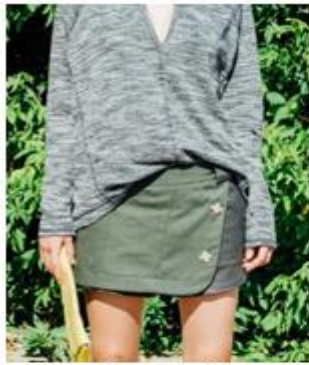
Figure 4: Skirt

Meanwhile, Preloved (2016) uses vintage fabrics as one of their fashion design. Their online business and boutique produces recycled apparels for women, children and household furnitures with more than 400 shops. As of previous season, they made sweaters out of wool for shops in America. Apart from that, they also produced skirts that can be matched recycled wool pants and similar skirts that made of wool. It was found that even celebrities bought these products such as Julia Roberts, Daria Werbowy, Kate Hudson, and Christine Horne. Their designs sometimes combine old and new fabrics in one apparel. The apparels are often price between the range of $100-$200 (Figure 5) and the skirts are sold in retail priced at $149 (Figure 4).