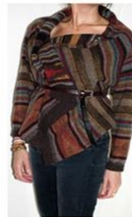
Figure 9: Sweater