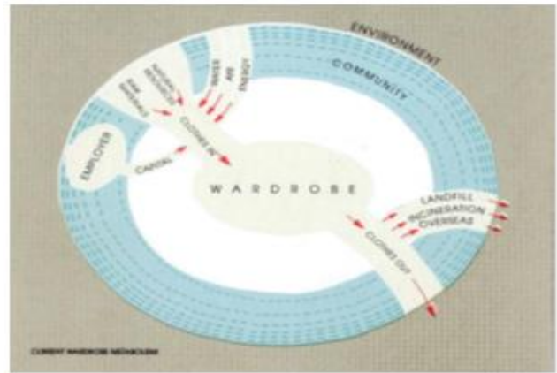
Figure 13 : Current wardrobe metabolism by Fletcher and Grose (2012)

Normally, apparel life-cycle is closely connected to the wardrobe metabolism. Wardrobe metabolism is how the apparel life starts from the second it was purchased from retailer or other resources or it was disposed or taken out from consumers' apparel stock (Xu, 2014). Fletcher and Grose (2012) concluded wardrobe metabolism in the Figure 13, simultaneously with the apparel life-cycle.