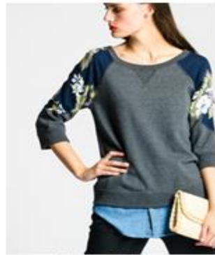
Figure 5: Blouse