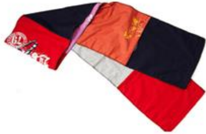
Figure 11: T-shirt Scarf

Figure 11 shows soft scarf T-shirt made in America. It was made from disposed T-shirts that are collected from apparel companies. These scarves are sewn by disabled individuals who learned to sew as a means to help them be independent.