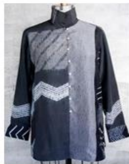
Figure 7: Blouse