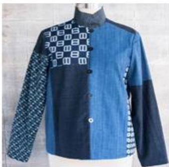
Figure 6: Jacket

Among others are Asiatica (2016), a company that produces apparels from Japanese kimono. Figure 6 and 7 illustrates the apparel designs produced which are luxurious and fashionable where they combined Japanese silk with recycled apparels (mixed vintage Japanese). They visit Japan twice a year to choose recycled materials. Apparels sold normally priced about 1450 USD