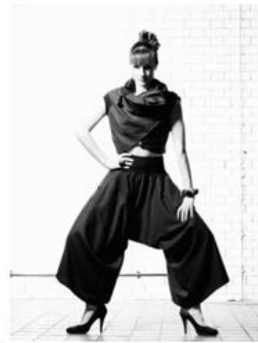
Figure 8: Sweater

Styling Junky (2016) in London, came up in the Vogue magazine and known for its innovative designs that are of high quality designed from second-hand men clothes made into women fashion apparels (Figure 8). The company also ensures that there are no same design apparels, could be from same pattern but made of different fabric. The recycled textile materials are obtained from second-hand shops. They also published a book by the name of "Junky Styling -Wardrobe Surgery" where they frequently recycle (upcycling) wardrobes. The customers can bring few old wool coats and the designers will design something new and according to current fashion. The artful and attractive apparel designs of this company were highlighted in the art exhibitions around the world and in permanent collection in the Museum of Design, London.