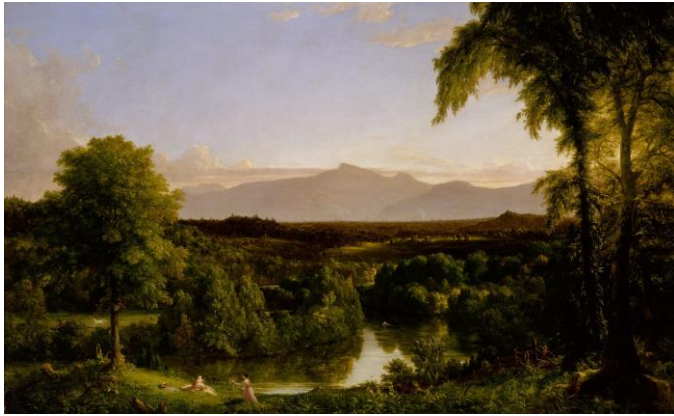
Figure 4. Thomas Cole, View on the Catskill, Early Autumn , 1837. Oil on canvas, 99.1 x 160 cm (39 x 63 in.). Metropolitan Museum of Art, New York. Gift in memory of Jonathan Sturges by his children, 1895.