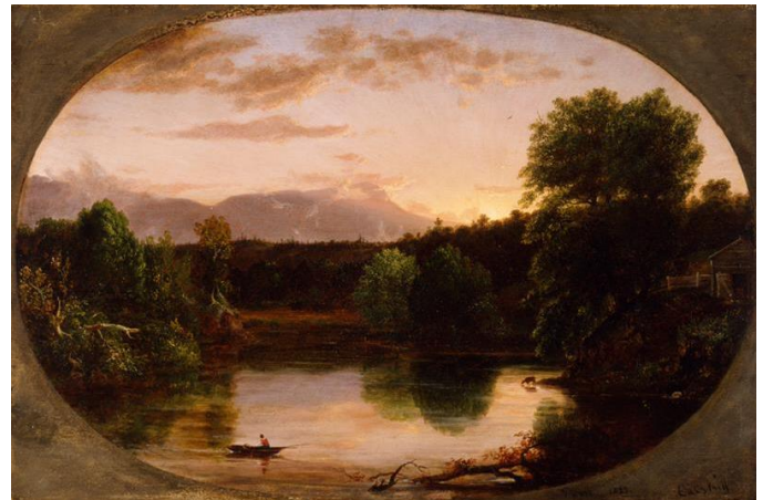
Figure 1. Thomas Cole, Sunset, View on the Catskill, 1833. Oil on wood panel, 41.9 x 62.2 cm (16 1/2 x 24 1/2 in.). New-York Historical Society, New York. Gift of The New-York Gallery of the Fine Arts.