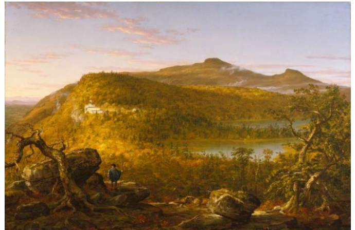
Figure 7. Thomas Cole, A View of the Two Lakes and Mountain House, Catskill Mountains, Morning , 1844. Oil on canvas, 91 x 136.9 cm (35 13/16 x 53 7/8 in.). Brooklyn Museum, New York. Dick S. Ramsay Fund.

Cole and Bartlett are similar and drawn from the same vantage point. However, no evidence confirms that Cole had seen Bartlett's Two Lakes before he created his first design of this scenery.