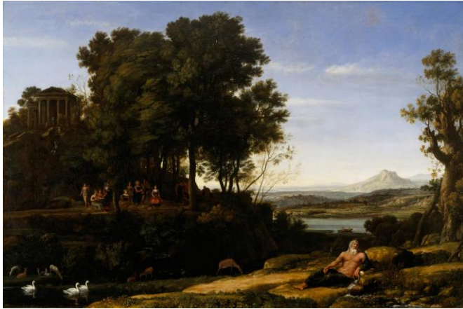
Figure 2. Claude Lorrain, Landscape with Apollo and the Muses , 1652. Oil on canvas, 186 x 290 cm (73 1/4 x 114 in.). Scottish National Gallery, Edinburgh. Purchased with the aid of the Art Fund and a Treasury Grant 1960.

Another detail referring to the concept of pneuma connects these paintings. Claude's Landscape presents a view on Mount Parnassus with the Temple of Immortality with Apollo resting under the trees. 40 The foliage of a tree hosting Apollo differs from all others, as if the wind moved only this tree's branches to indicate Apollo's divinity. In this specific detail, Lorrain alluded to the concept of pneuma as divine breath. Cole applied the same device in Sunset : a light wind touches the tree branches in the wilderness, on the left shore, but not on the right bank over the dwelling of man who destroys nature.