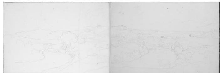
Figure 6. Thomas Cole, River Landscape (Catskill Creek from Jefferson Heights) , September 8, 1842. Sketchbook 1839-44 pages, folios 5 verso – 6 recto. Graphite on cream wove paper, 28.4 x 43 cm (11 3/16 x 16 15/16 in.). Princeton University Art Museum, Princeton. Gift of Frank Jewett Mather Jr.

Sketchbook 1839-44 (fig. 6). Folios 5 verso and 6 recto of this book contain two sketches: a brief outline on the left and a detailed study drawn over both folios after the completion of the outline, the method Cole used in Catskills Sketchbook . The outline on folio 5 verso of Sketchbook 1839-44 is similar but not identical to Early Autumn , which indicates that the artist kept the composition of this painting in mind while sketching from nature. The detailed study shows the main features of River in the Catskills : railroad, absence of trees, angular river bends, and mountains shifted to the right. Cole made a date inscription on folio 6 recto: "September 9 th , 1842." He created both drawings on this day, outlining after Early Autumn and studying the scenery for River in the Catskills according to his method of successive compositional revision.