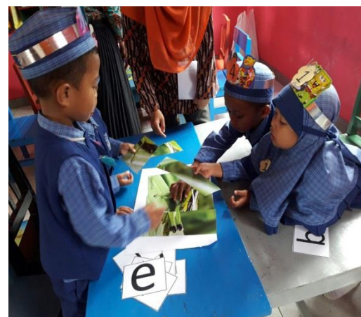
Figur 1. The Process of Students Working in Group on Cooperative Learning Technique Numbered Heads Together

Cooperative learning process technique numbered heads together lasted for 8 days. In 8 days guided by kindergarten teacher. In this process all students sit in small groups of up to 4 children. Subject seating is arranged based on teacher choice.