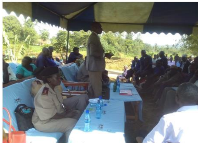
Plate 5.1: Chief Isongo Location And Sub-County Education Officer Solving:

children from schools to join armed groups.