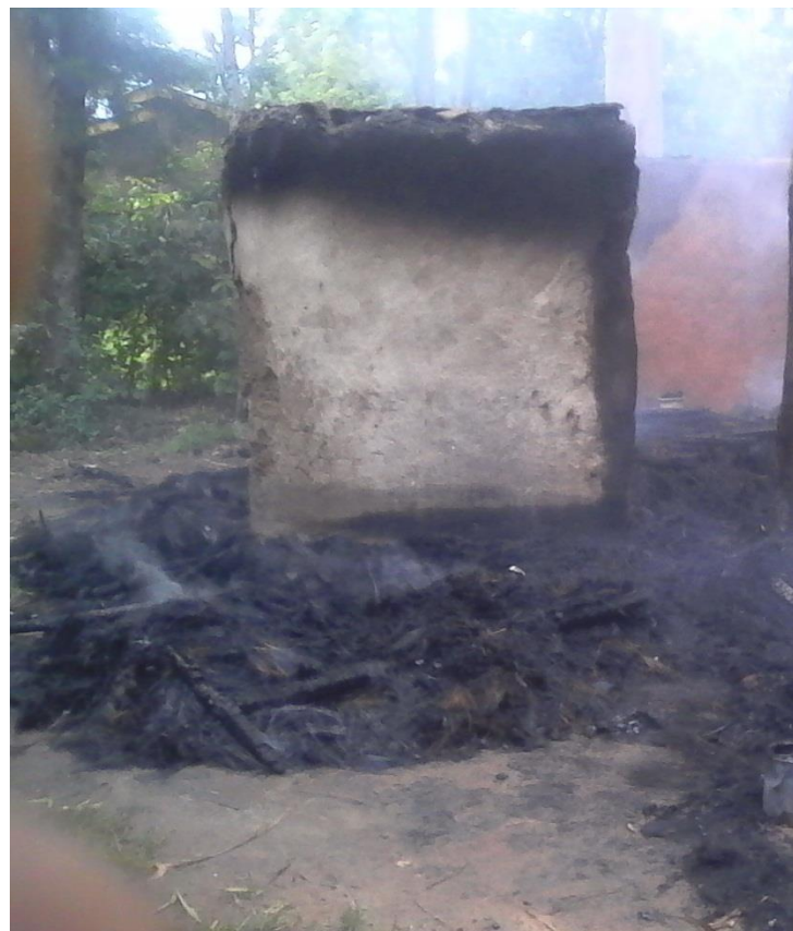
Plate 5.2: a house burned to ashes due to inter-clan conflicts in emakhwale sub-location

From the findings one household head indicate that people's business has been destroyed and nobody takes care. He called upon the government to intervene these endless inter-clan conflicts. Another key informant ward administrator east wanga ward also supported the findings that inter-clan conflicts leads to destruction of property and mentioned an incident of emakhwalesub-location where a house was burned to ashes and provided the plate bellow. However it also emerged from maraba fgd where out of 8 participants 7 of them indicated that inter-clan conflicts have led to destruction of property in shopping centres especially in shops. From the findings it is clearly indicated that there is destruction of property as a result of inter-clan conflicts in the area of study.