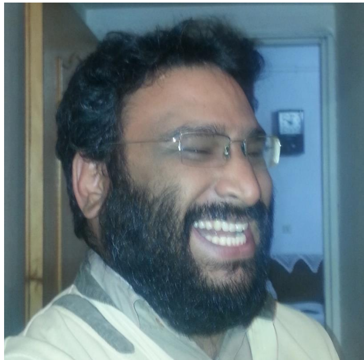
Figure 3 – My photo with beard.

Currently I have no religion. Now I have a long beard and my photos are present at my FACEBOOK page [38] and are in access in Google search engine Image section. It is also available in Figure 3.