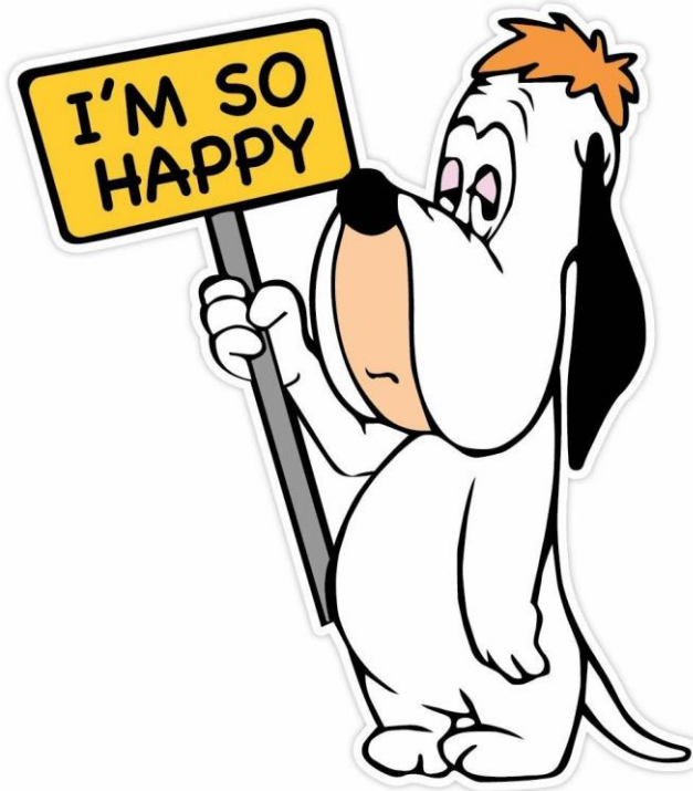
Figure 1 – Droopy Dog with its iconic quote.

they are not successful at all. Whereas droopy wins the completion and catch a group of foxes without any effort. This episode is available in YouTube [8, 9 and 10]. The song of “Labkhand” from Mr. Dariush Eghbali is very similar to this “Droopy Dog” animation. This song is available in YouTube [11]. The “Sadder but Wiser” effect or DEPRESSIVE REALISM principles can be truly seen in Iranian society since the official news agency of TABNAK officially says that Iranian managers employ weak people [12]. TABNAK news agency is approved by Iran government. Anyway down with Iran regime for this DEPRESSIVE REALISM. However, life like an animal is not valuable at all. In Iran everybody behaves according to the principles of DEPRESSIVE REALISM in this way that the university professor lowers the grades of intelligent person, the manager does not give the job to intelligent person, the friend leaves the intelligent person, the father takes intelligent person to the psychiatrists and etc.