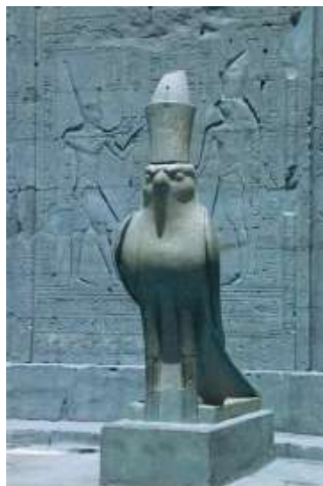
Figure 6: Horus, the Egyptian bird god