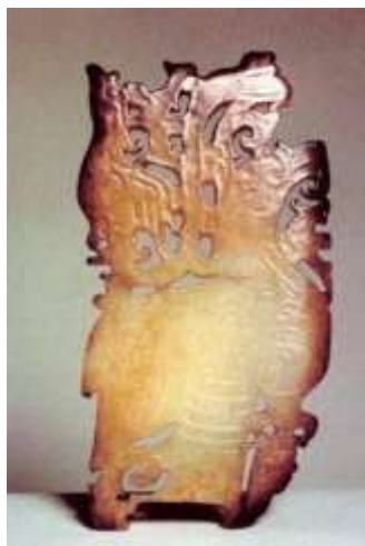
Figure 2: The business eagle will capture the first jade pei. business. 10.2 centimetres by 4.9 centimetres. Shanghai Museum of Jade (cite from Pan Shouyong, Lei Hongji 2001)

Jesus seemed to have lived his entire existence in close proximity to the flying God, leaning on Him and following Him. It reminded me of "Peacock Akihito," a picture in the collection of the Tokyo Museum of Art that says the Buddha was incarnated as a peacock. It makes little difference whether God is depicted as a peacock or a bird, yet there are other similar representations in world religious imagery. Antiochia, a Greek philosopher who was born in 444 B.C., stated, "Since God is nothing, no one can comprehend him through an analogy." Or, as it is stated in the Hindu Upanishads, "It is both known and unknown." [Figure 1] Does